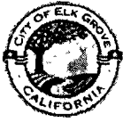
TABLE OF CONTENTS Contract for GOODWIN CONSULTING GROUP - CONSULTANT (continued)